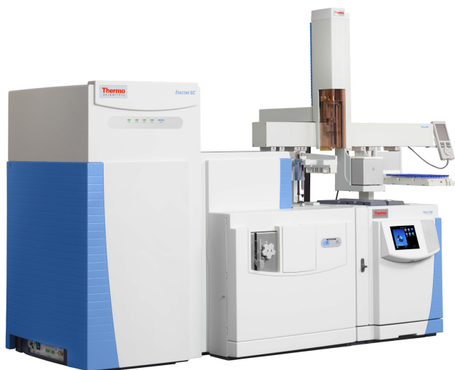
Exacte GC mass spectrometer with TriPlus RSH autosampler.