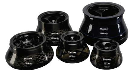
Figure 1 A full range of carbon fiber rotors is available, all with significant weight and life span advantages.

The high rotational speeds generating centrifugal force create load or stress on the rotor, with ultraspeed rotors experiencing the highest level of