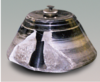
Figure 3 The catastrophic failure of a rotor due to unchecked corrosion.

stress of all rotors. However, it is also an important consideration for lower-speed rotors, which also experience substantial g -forces.